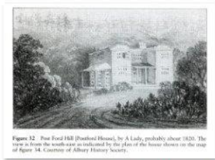
FV12 Rev Holt's House Post Ford Hill Postford House by A Lady c1820.jpg