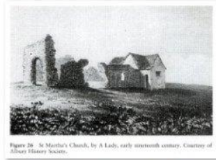
FV13-14 St Martha's by A Lady.jpg