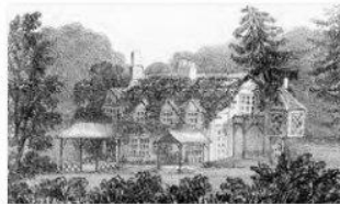
FV9 Fourteen Views of Albury from Surrey History 2009 The Cottage, Chilworth Road, Miss Malthus' Cottage.jpg