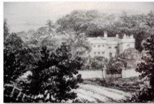
FV6 32 Fourteen Views AP13 32 Weston House.jpg