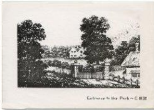
FV5 Entrance Albury Park c1832 by Albury Trust.jpg