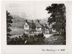
FV8 The Rectory c1832 by Albury Trust.jpg