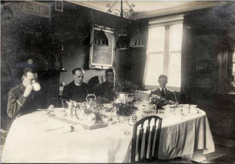
Breakfast. Wonderful display of empty breakfast 1915.