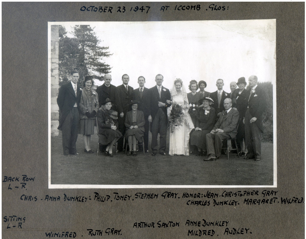
OCTOBER 23 1947 AT ICCOMB .GLOS: