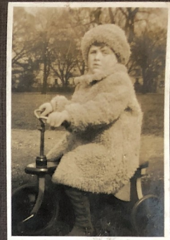
IN RECENTS PARK