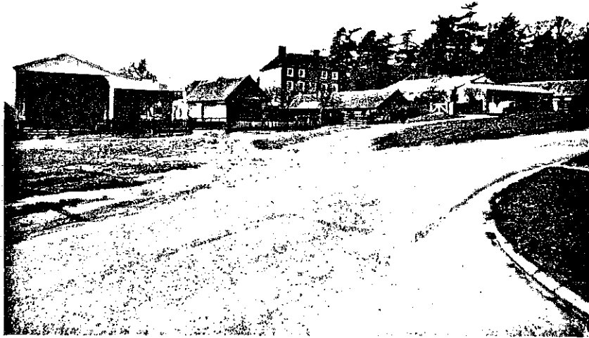
A GENERAL VIEW OF THE BUILDINGS AND HOUSE