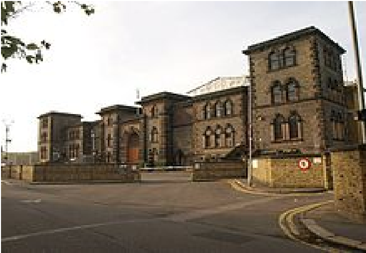
Wandsworth Prison. Built in 1849.