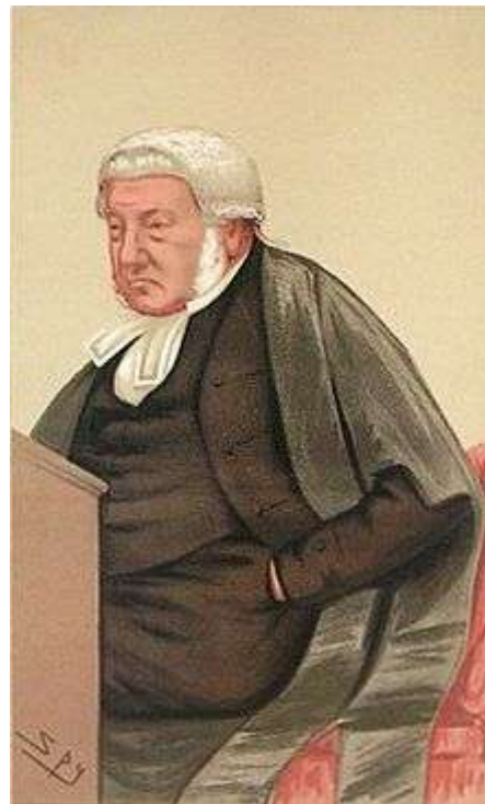
George William Wilshere Bramwell, 1 st Baron Bramwell. (1808 – 1892).